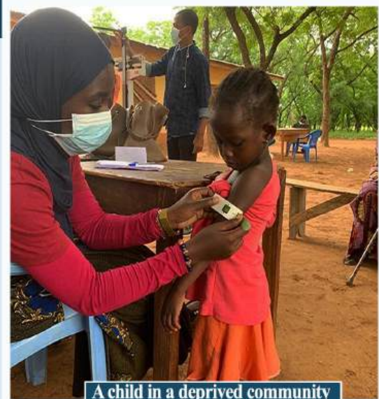
A child in a deprived community undergoing free health screening

The Ghana Health Service (GHS) under the Ministry of Health (MoH) in partnership with some health facilities embarked on a number of activities to mark the day. These activities include free health screening, public lectures and health walks among others